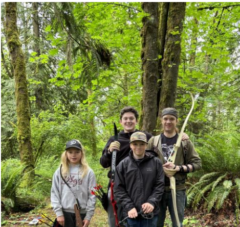
Tap here to add a caption